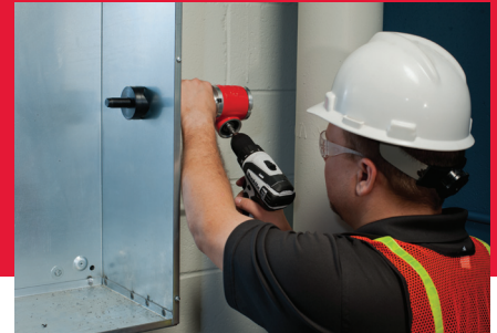
Perfect for tight places

The Gardner Bender mechanical driver is a compact, light-weight and field-serviceable knockout tool operated by a single person. Hydraulic drivers require hoses, seals, larger size tools and most need two people to operate.