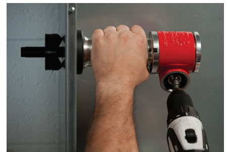
Self-centering punch and die