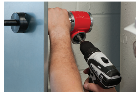
3/8" Dual square drive